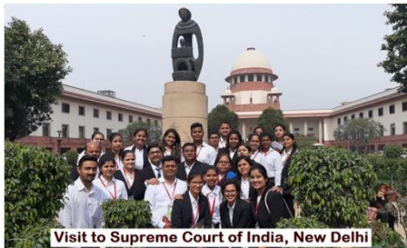
Visit to Supreme Court of India, New Delhi