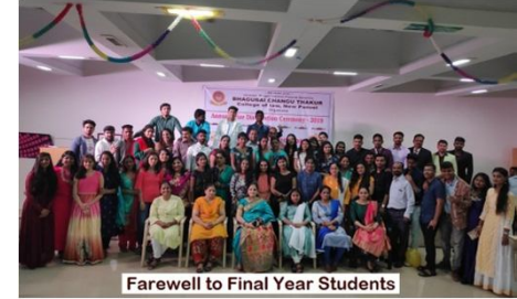
Farewell to Final Year Students

Plot No. 4, Sector 11, Khanda Colony, New Panvel (W), Dist. Raigad, Navi Mumbai - 410206