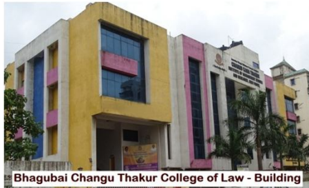
Bhagubai Changu Thakur College of Law - Building