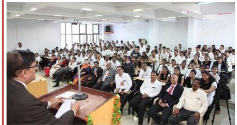
Hon'ble Justice Shri. Abhay S. Oka, Judge, High Court, Bombay