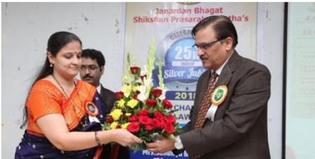
Inauguration of Late Shri. Janardan Bhagat Memorial Lecture Series by Hon'ble Justice Shri. Abhay S. Oka.