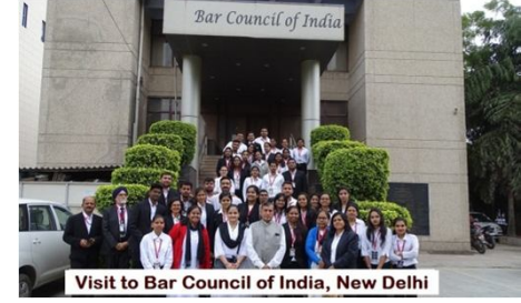
Visit to Bar Council of India, New Delhi