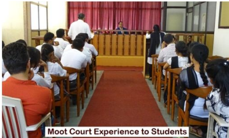
Moot Court Experience to Students